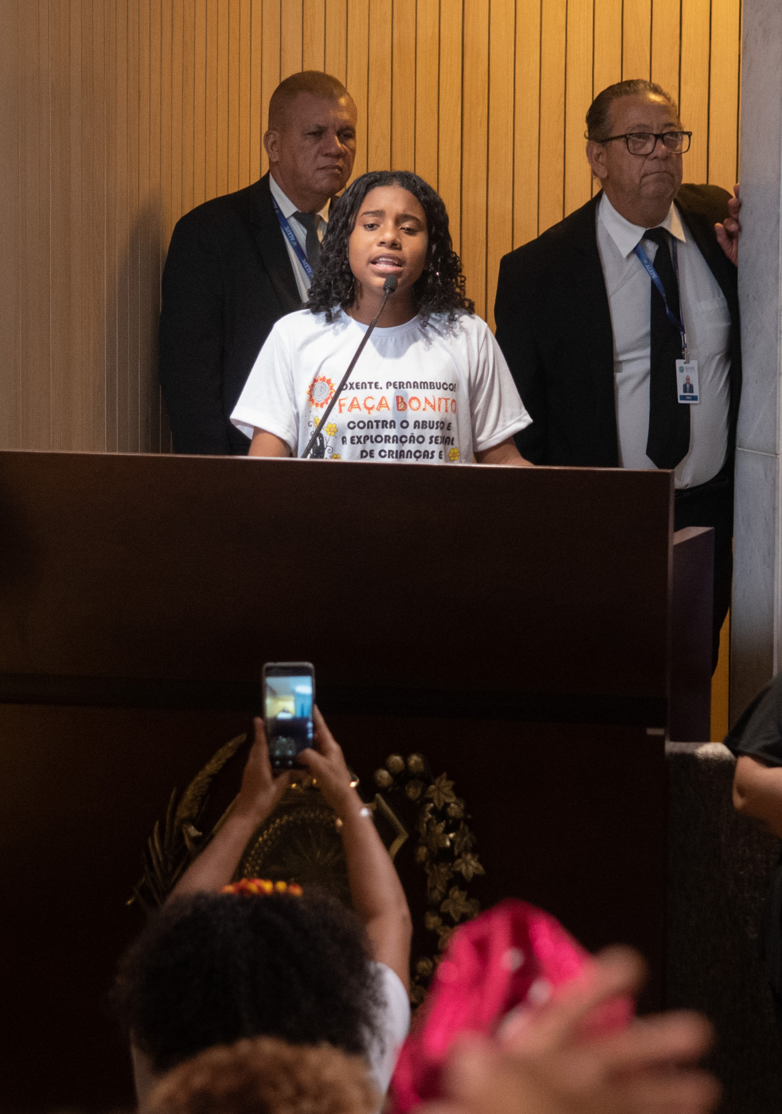
A beneficiary of Freedom Fund partner Casa Menina Mulher speaks at a public hearing on the National Day to Combat Abuse and Sexual Exploitation against Children and Adolescentson at the Pernambuco State Parliament.