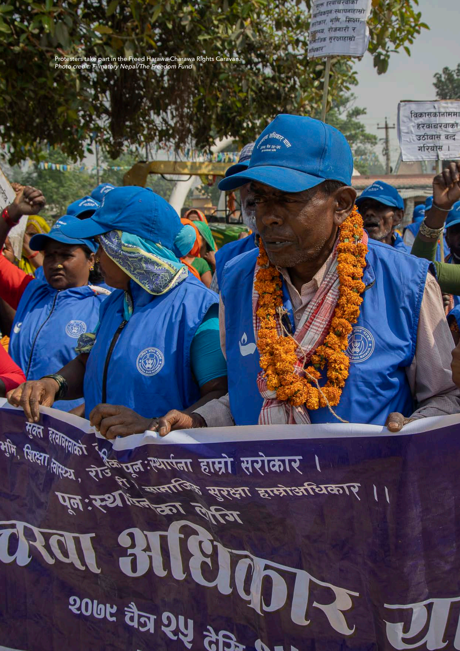
Protesters take part in the Freed Harawa-Charawa Rights Caravan.

मुक्त हरवाचरवाको विकल्प स्थापनाहाम्रो सरोकार, भूमि, शिक्षा, स्वास्थ्य, रोजगारी र सामाजिक सुरक्षाहाम्रो अधिकार