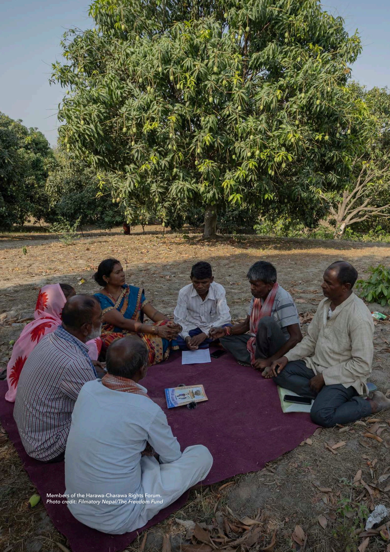
Members of the Harawa-Charawa Rights Forum.